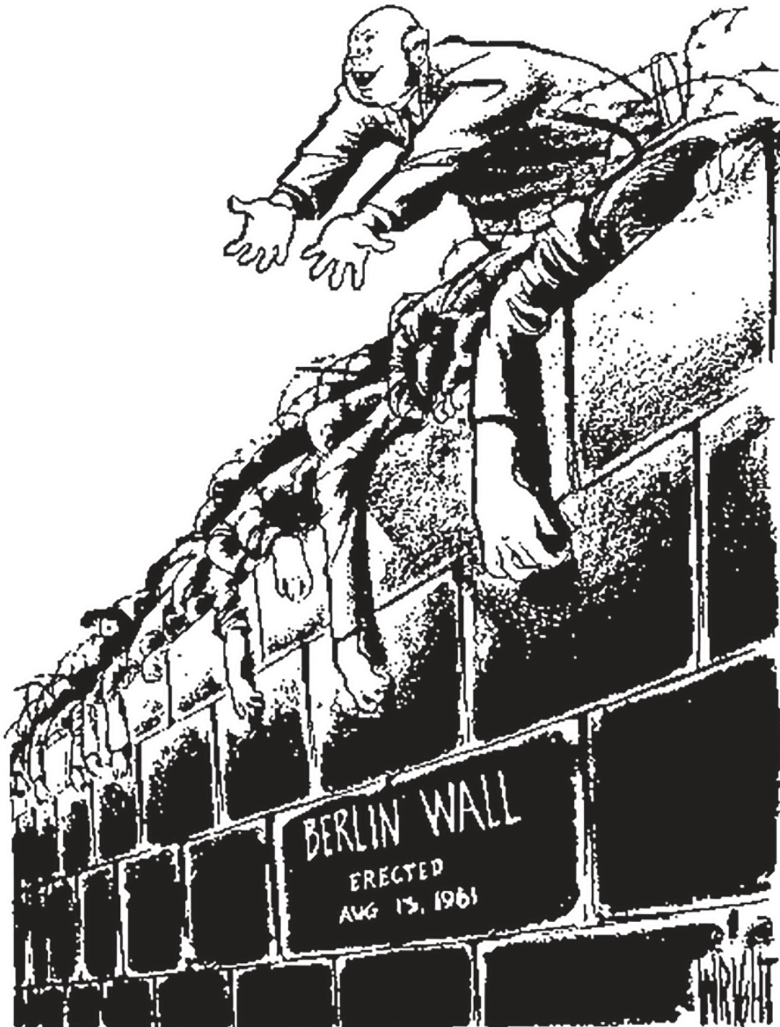
A cartoon published in an American newspaper in 1961 soon after the construction of the Berlin Wall. The figure at the top represents Khrushchev.