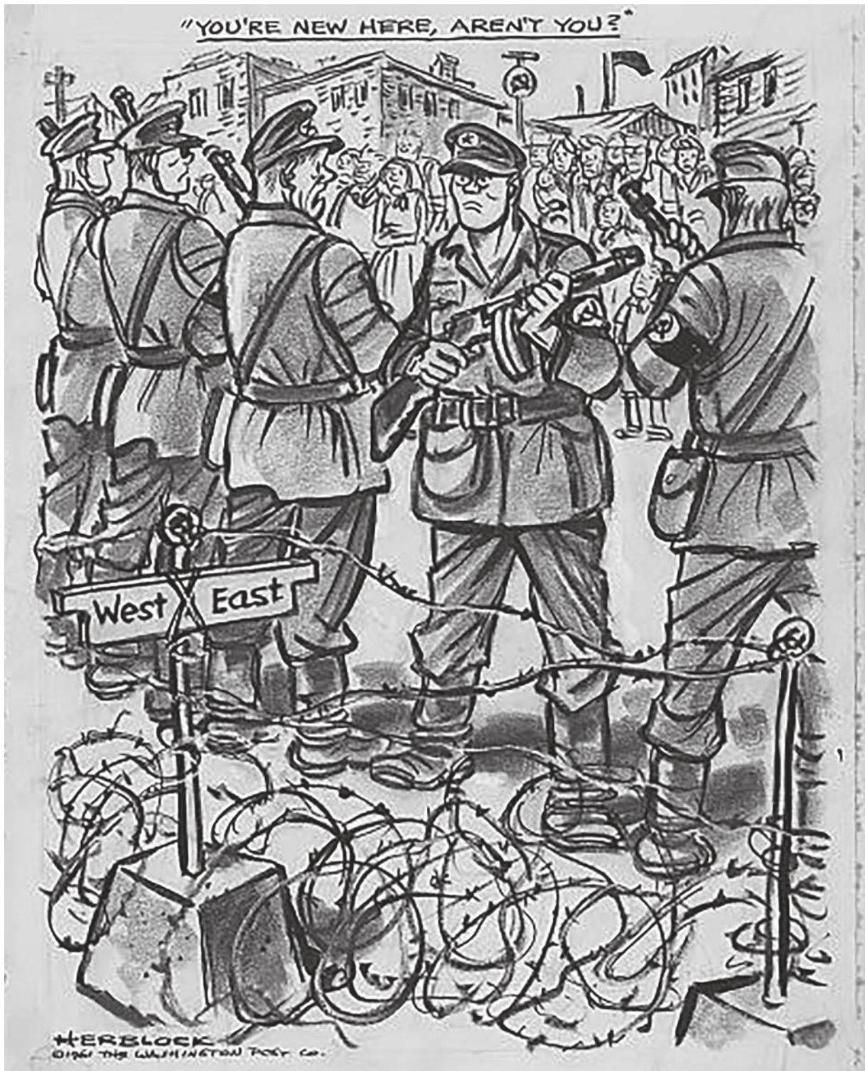
A cartoon published in an American newspaper, 30 August 1961.